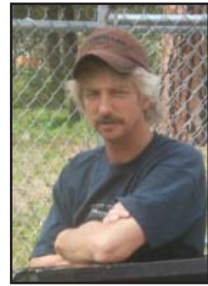
Wardrobe, Hair, Makeup Crystal Piche